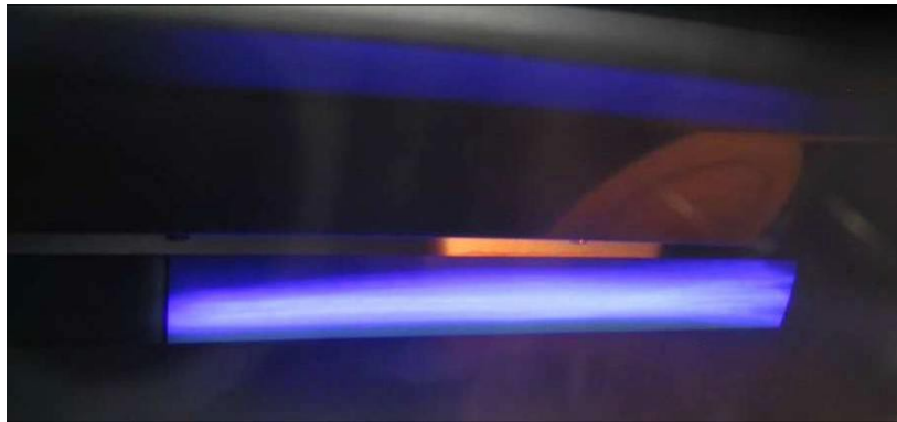
Fig 2: Electron beam induced bias – electron beam while metalizing PET.

An electron beam induced bias allows a higher charge of the film compared to conventional bias due to the immobile, static charge. The pressure of the film to the cooled surface and accordingly the heat transfer coefficient can be increased by one order of magnitude during the time before the substrates are exposed to the heat load, i.e., when the metalizing takes place. In addition, the cooling of electron beam bias is effective during the whole time the plastic film is in contact to the cooled surface.