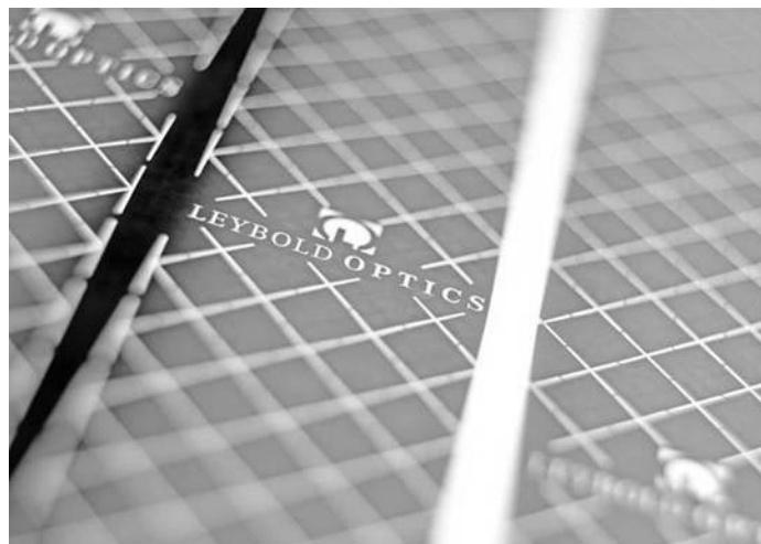
Fig 1: Capacitor film with Al / Zn-HE layer and diamond margin

The system consists of an oil evaporator, anilox- and flexo roller. The oil evaporator is an indirectly heated tube and is used as the oil reservoir. The anilox- or transfer roller is made of steel with a ceramic surface and structured with small saucers. The flexo roller consists of a pneumatical cylinder, adapter and sleeve. The structure of the sleeves is the reference to different products. There are diamond-, T-, TD- and special structures in different sizes and dimensions available.