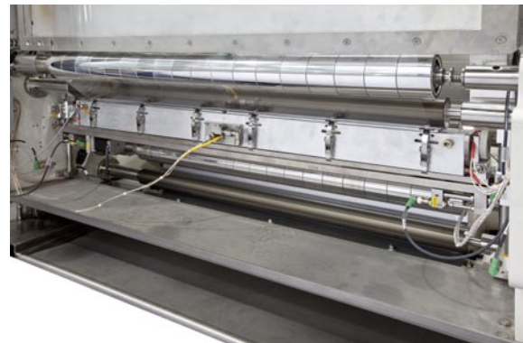
Fig 2: Free margin oil evaporator – service position Fig 3: Free margin oil evaporator – working position